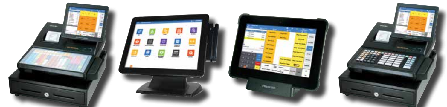
SAM4s SAP-530 FT Flat Spill-Resistant Keyboard; 3" Receipt Printer