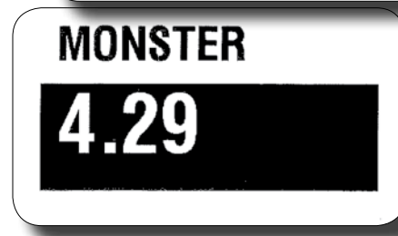
Labels printed on the SNBC BTP-L520 thermal desktop label printer shown actual size.