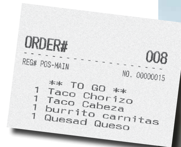
Kitchen requisition printed on the SAM4s Ellix 40 80mm receipt printer shown 75% actual size.